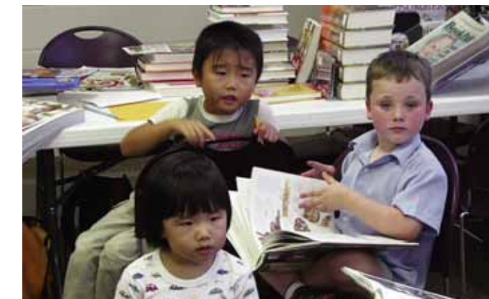
Young readers at the temporary Byram Shubert Branch Library.

Byram Shubert While the expansion and renovation of the Byram Shubert Branch Library is underway, services are being temporarily housed in the community building of St. Paul Lutheran Evangelical Church adjacent to the library grounds. Concerted efforts are being made to keep the community apprised of progress as this project proceeds from conception to completion. The Byram Shubert Friends' first event in their temporary home was to continue the tradition of the festive annual community tree-lighting and sing-along. Children's programs were scheduled monthly at the Byram Archibald Neighborhood Center once the move was complete. In May, the Byram Friends hosted a 75th Byram Shubert Library anniversary event that included family entertainment and a neighborhood "search" for earlier