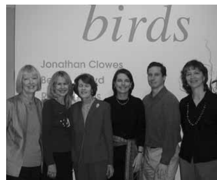
Show curators joined some of the artists whose work was on display at the Flinn Gallery's exhibit, "Birds." The gallery is sponsored by the Friends of the Library.